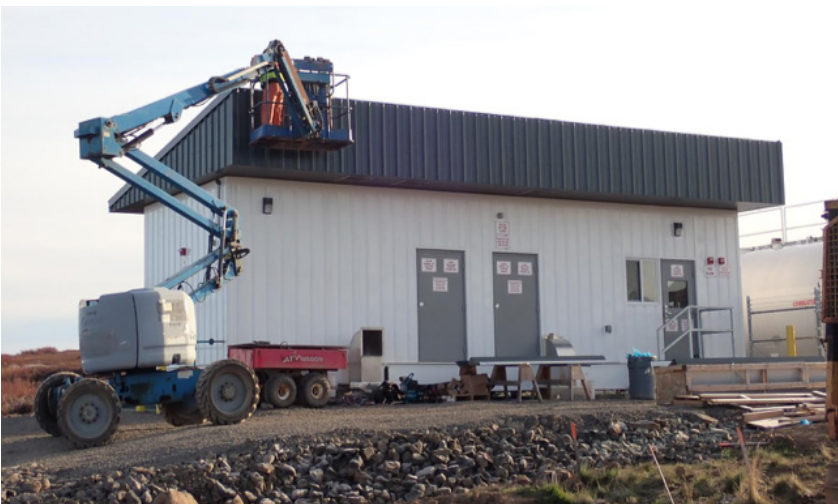
Power plant module (10/31)