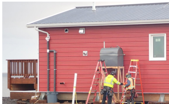
Installing fuel tanks at the new houses (10/4)