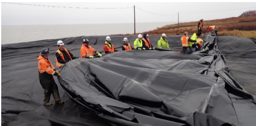
Spreading liner at the bulk fuel farm (10/9)