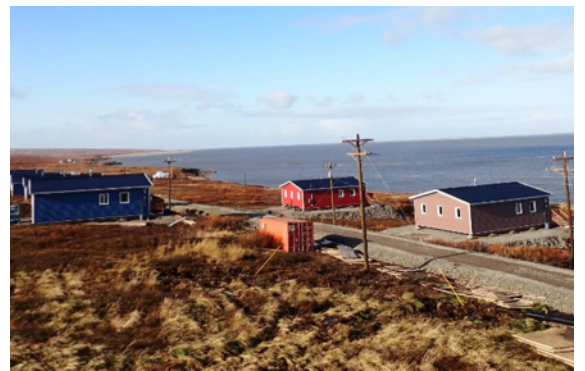
Ungusraq Street and houses