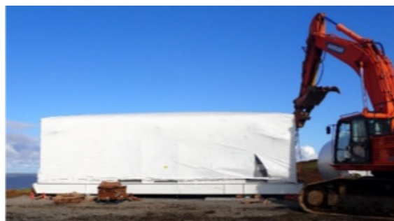
Transporting the power plant module (9/13)