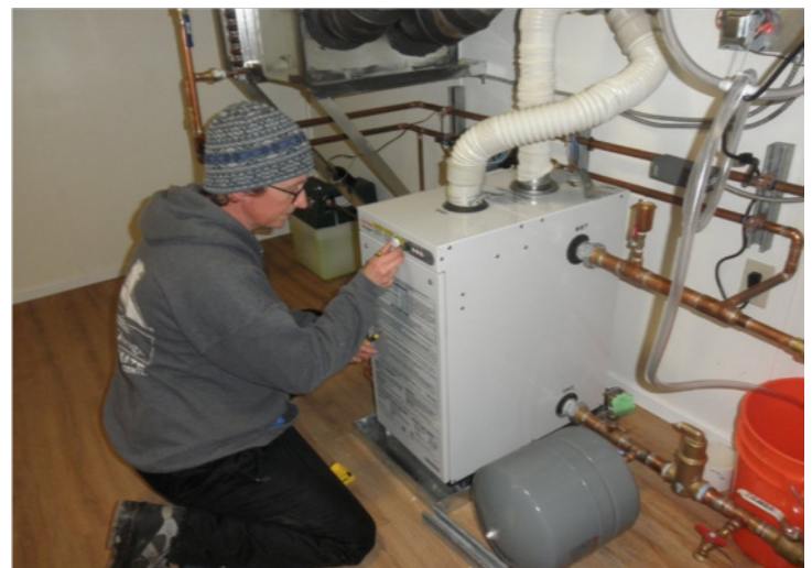
CCHRC commissioning BrHEAThe systems (10/7)