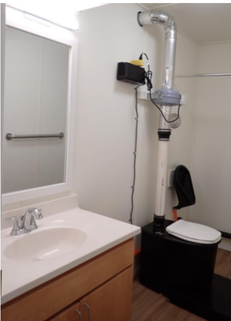
PASS unit in the bathroom (10/5)