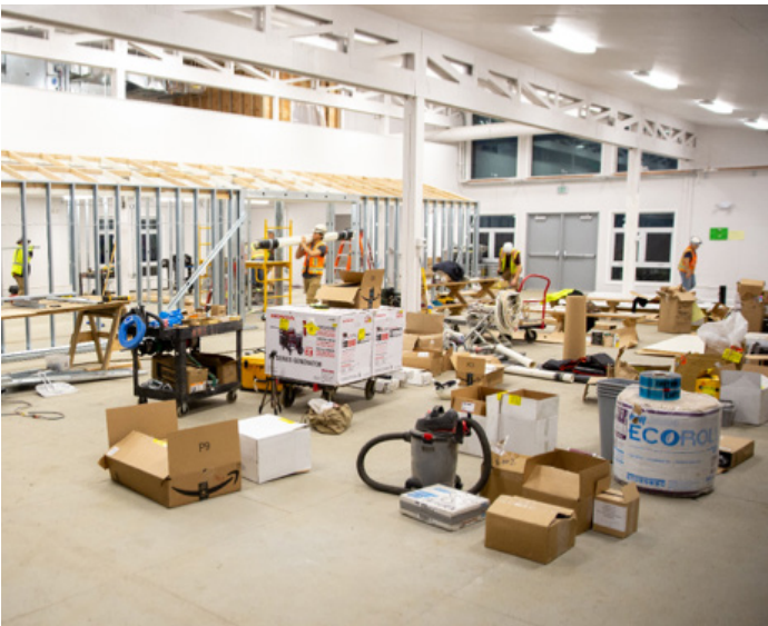
UICC working to build classrooms in the MEC interior (10/22)