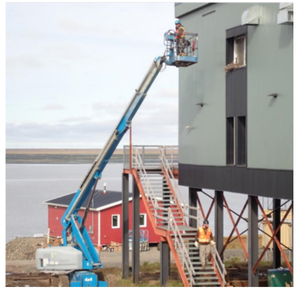
GCI installing antennas on the MEC (9/22)