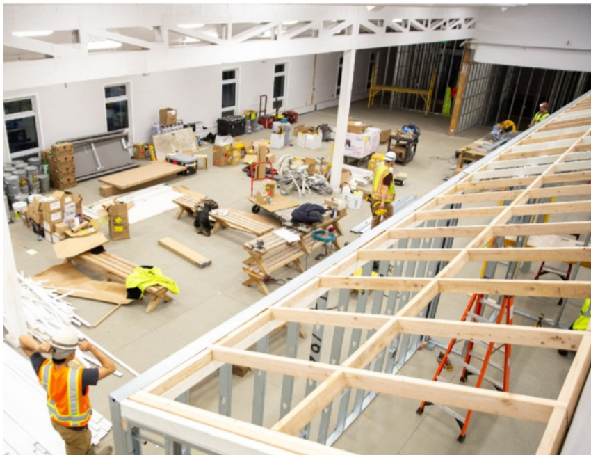
Building classrooms inside the MEC (10/24)