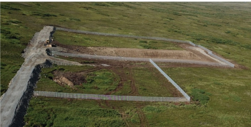
Landfill with fence (9/16)