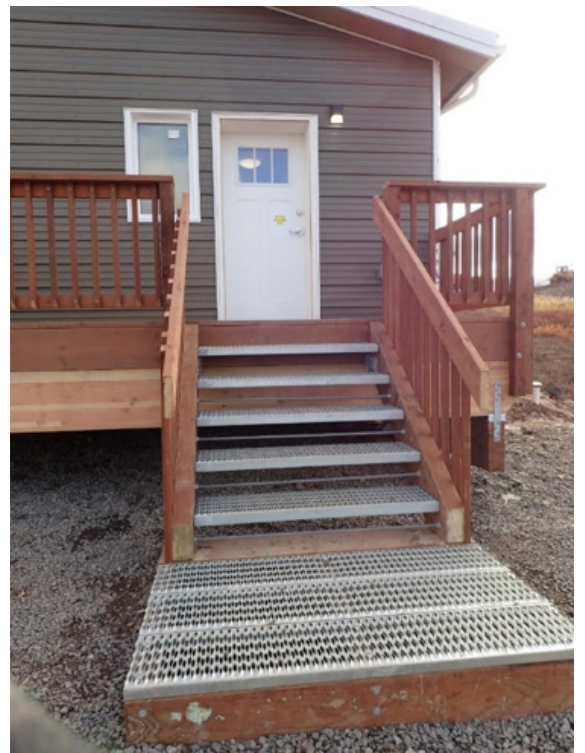
CCHRC houses have slip-proof entrance stairs (10/6)