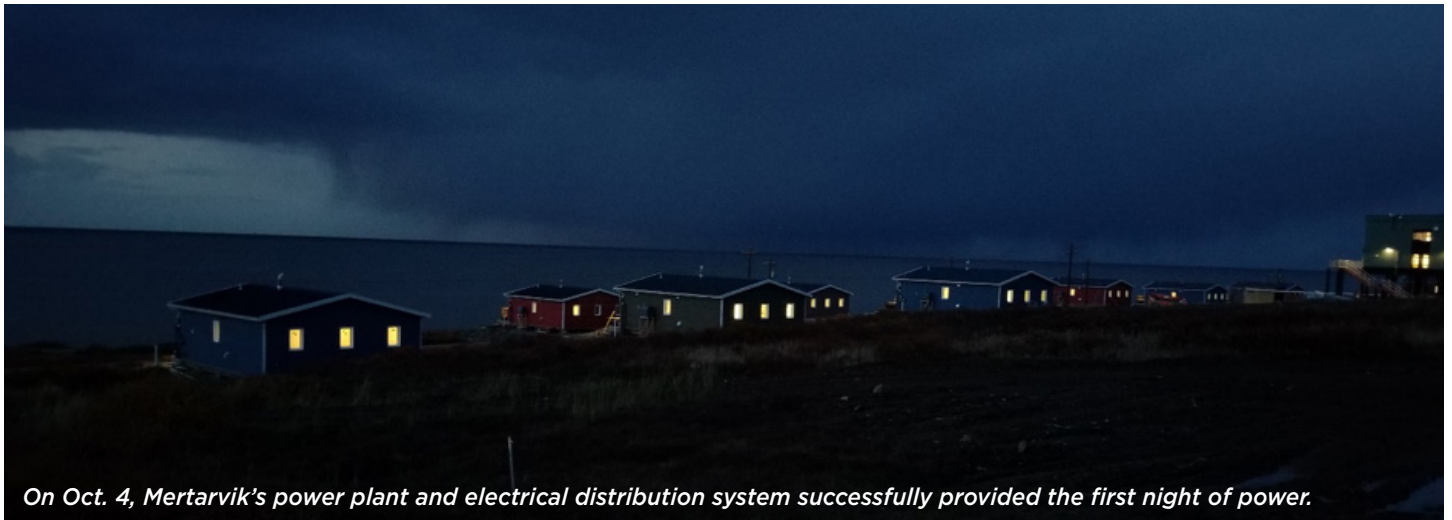
On Oct. 4, Mertarvik's power plant and electrical distribution system successfully provided the first night of power.