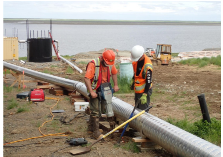
Installing arctic pipe from the MEC to the MBR to provide sewage service to the MEC (6/24)