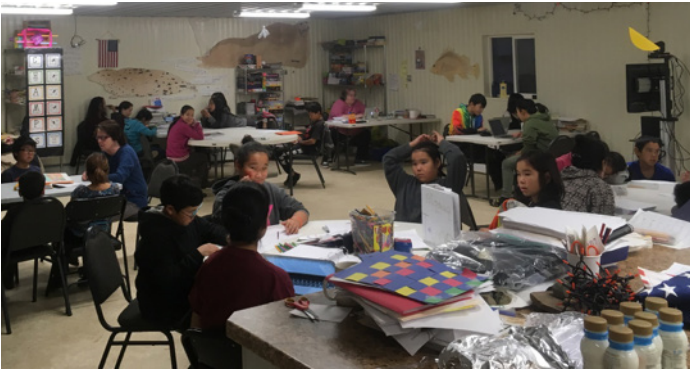
LKSD classes were held in the NVC Mancamp cafeteria until the MEC interior was retrofitted with three classrooms (10/22)