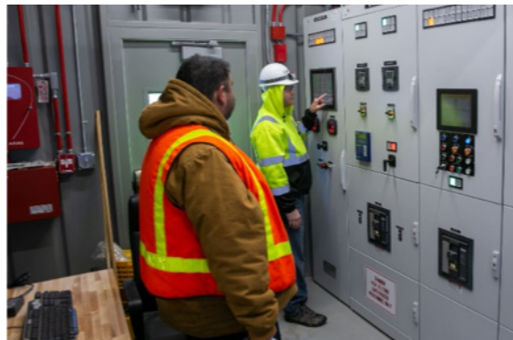
Inspecting the power plant (10/23)